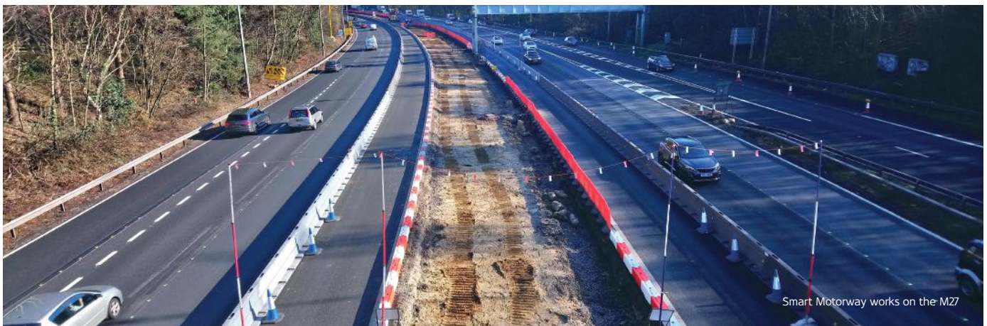
Smart Motorway works on the M27