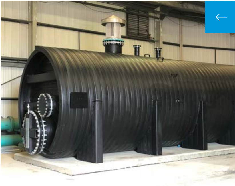
3000mm dia Potable Water Balance Tank, Broadfields, Isle of Wight

Drinking Water Directive (98/83/EC) and satisfy DWI Regulation 31 Reference number DWI 56.4.513 "Approved for use in public water supplies" as well as earning WRAS approval