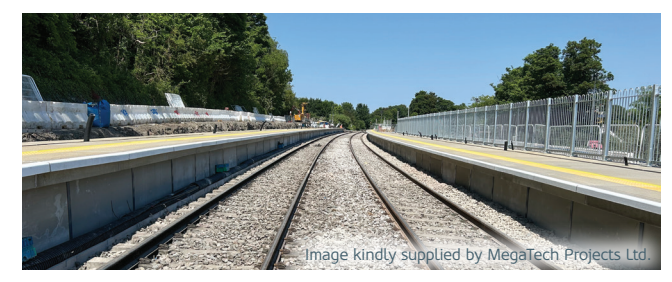
Ashley Down is the second of the first two new rail stations that will be opened in Bristol for almost a century.